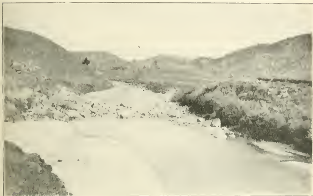
THE REPUTED HAUNT OF U KSUID TYNJANG.

To lure people into his grasp, he used to imitate the human voice and to shout " Kaw-hoit, Kaw-hoit! " the common signal-cry of people who lose their companions or their way—a cry to which all humane travellers